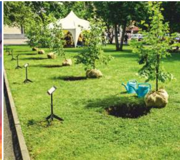
Plantation & Landscaping