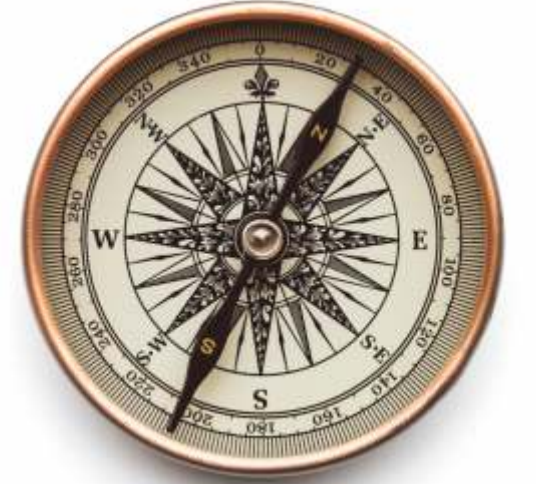
Planned as per Vasthu