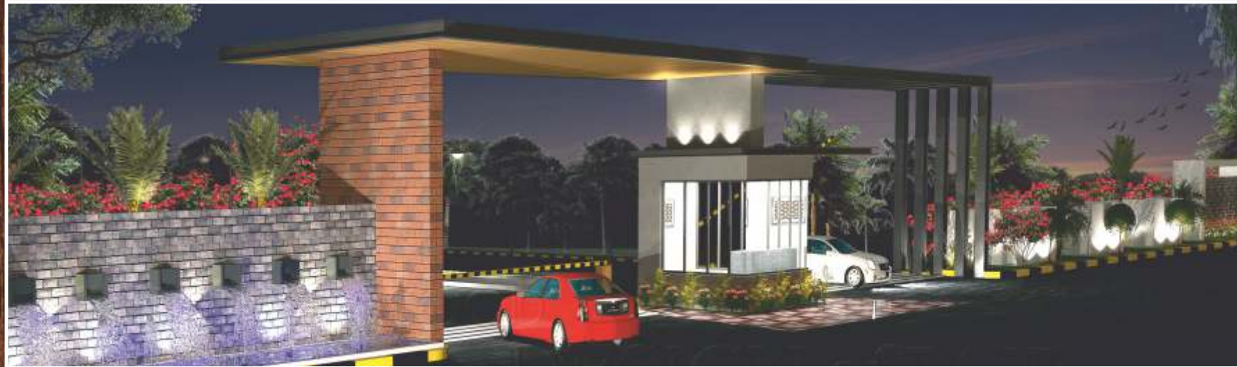
Majestic Entrance Gate