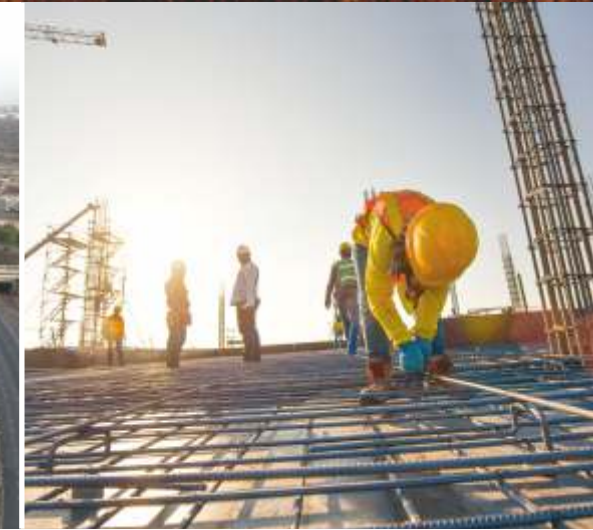
High Quality Construction